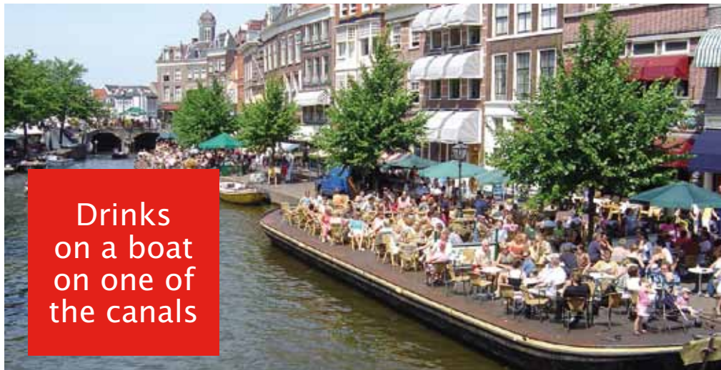
Drinks on a boat on one of the canals

the end of your registration. Ending your registration is possible from one month to five days prior to your departure from the Netherlands. It is possible to end your registration in person, by post or via the internet. If you do not fill in a departure date, the day on which the municipality receives the document will be regarded as your departure date.