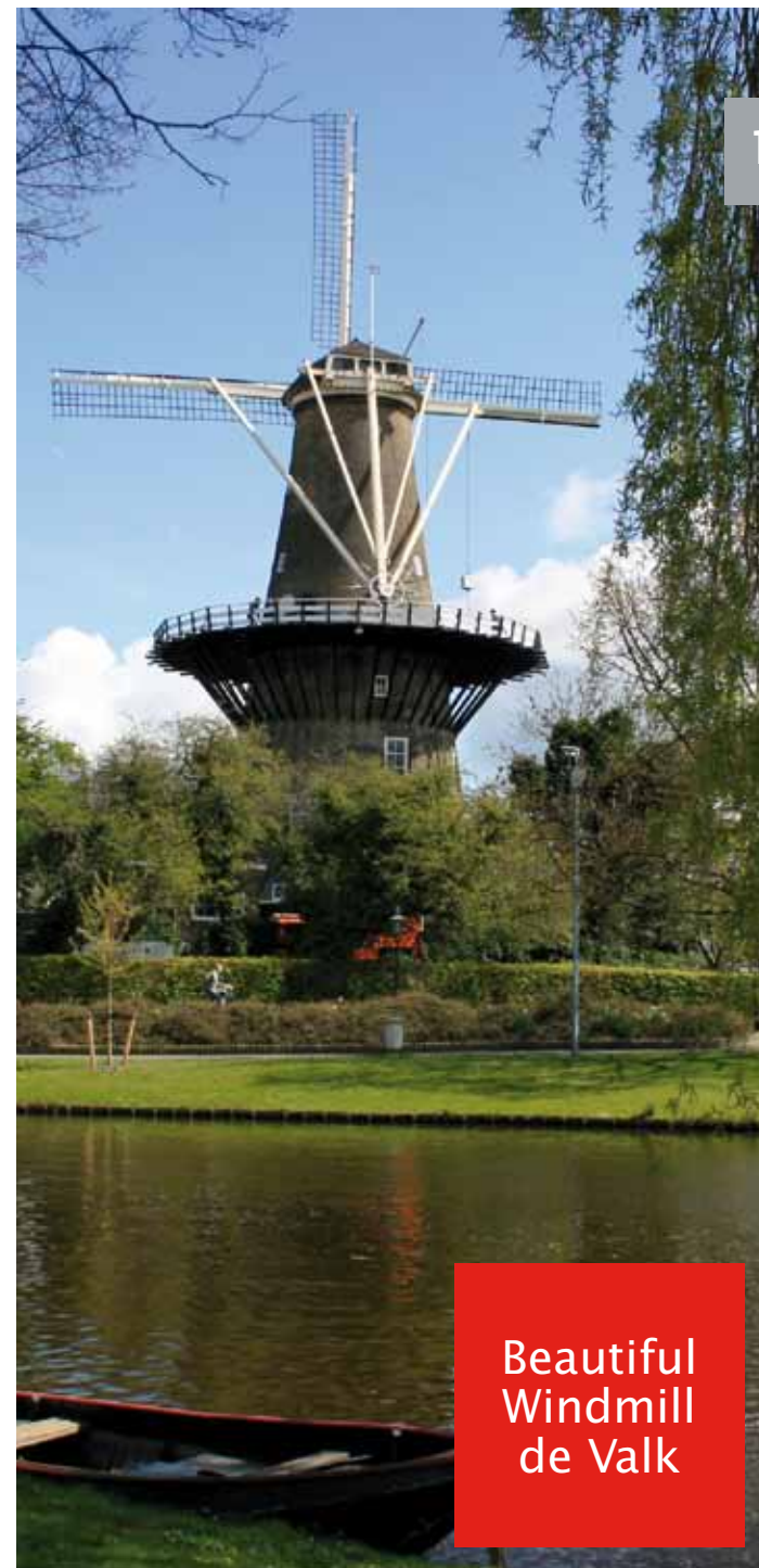
Beautiful Windmill de Valk